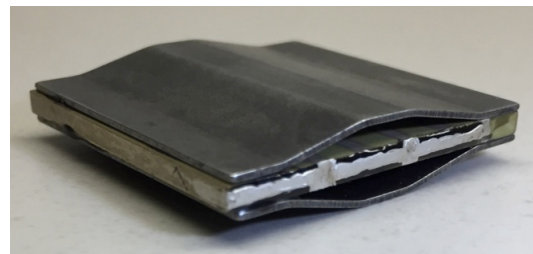
Figure 2. Novel bridge transducer.